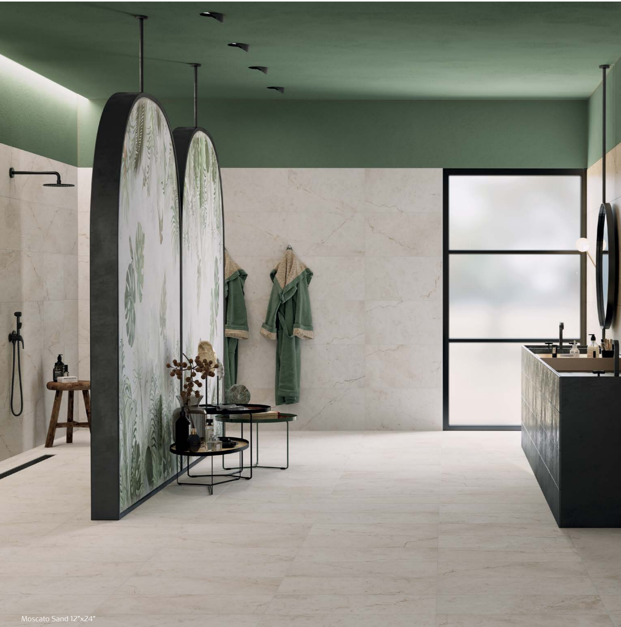
Moscato Sand 12"x24"

Inspired in the all-time favorite Crema Marfil, updated into a seamless pattern with gold and sand undertones. Emphasized by the carving in the veining, to bring more authenticity to the marble.