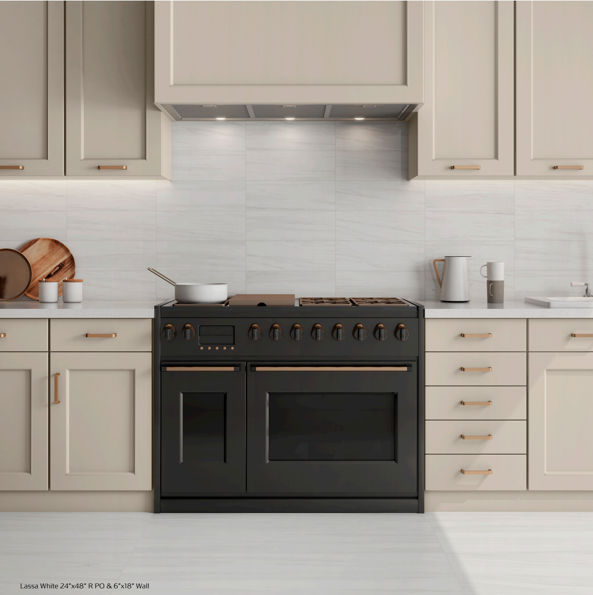
Lassa White 24"x48" R PO & 6"x18" Wall

Lassa White, relaxed and serene beauty, created through the delicate visual interplay of its parallel lines and subtle changes in tone. Its polished finish also brings brightness into designs.